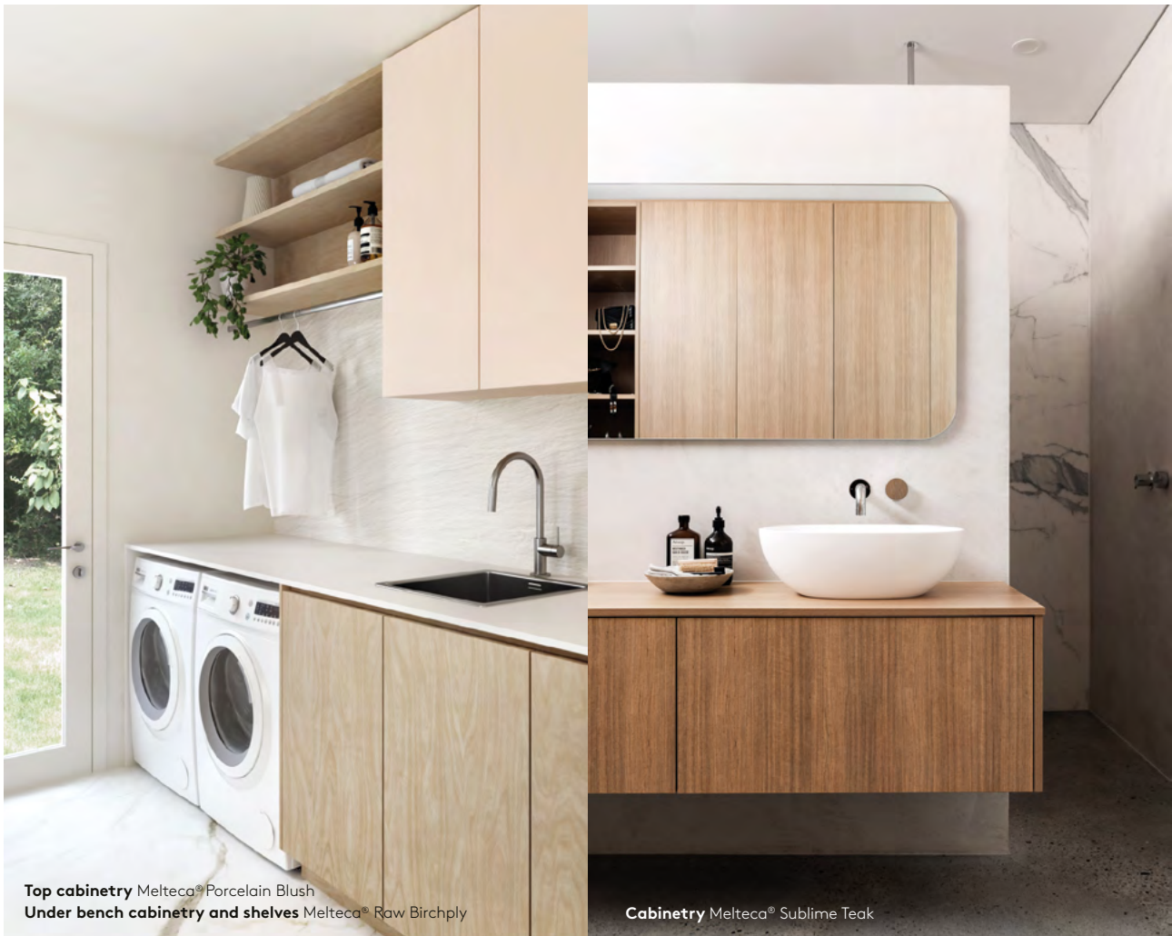
Top cabinetry Melteca® Porcelain Blush Under bench cabinetry and shelves Melteca® Raw Birchply

Laminex® New Zealand (FSC-C102329) has achieved Forest Stewardship Council (FSC®) and Programme for the Endorsement of Forest Certification (PEFC), Chain of Custody certification for all our local manufacturing plants, along with the entire supply chain. This means that all certified wood products from these plants are produced using responsibly sourced wood fibres.