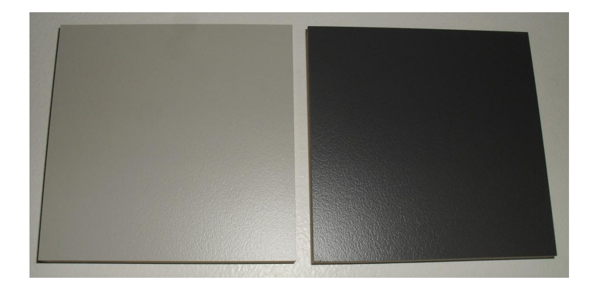
Figure 1 Representative specimens (exposed face of "Seal Grey" on left, "Storm" on right)

The product submitted by the client for testing was identified by the client as Melteca, a low pressure melamine (LPM) on MDF comprising melamine saturated paper laminated to both faces of nominally 12 mm thick MDF. Figure 1 illustrates a representative specimen of that tested.