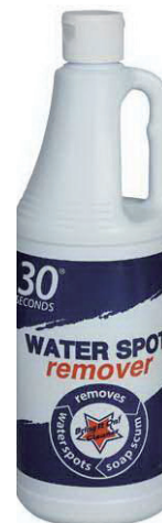
30 Seconds Water Spot Remover