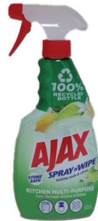
Ajax Spray n Whipe