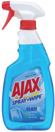
Ajax Spray n Wipe Glass