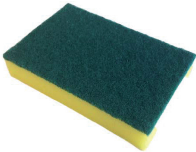
Green Scotchbrite Pad