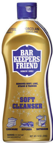
Bar Keepers Friend Tile cleaner