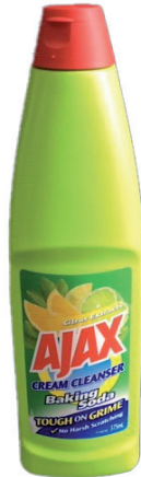
Ajax Cream Cleanser