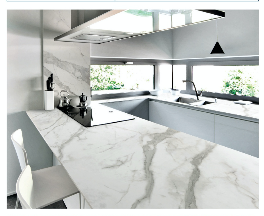
Registered\ under\ the\ mutual\ recognition\ between\ EPDI taly\ and\ Other\ Program\ Operator.