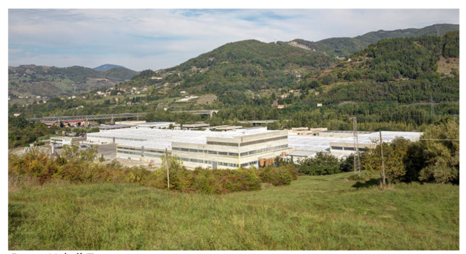
Borgo Val di Taro