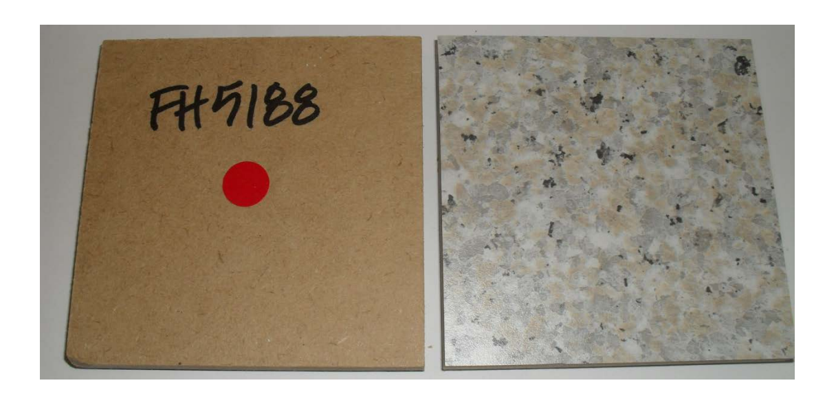
Figure 1 Representative specimens (unexposed face on left, typical exposed face on right)

The product submitted by the client for testing was identified by the client as Formica and Laminex High Pressure Laminate on Lakepine MDF Substrate. Figure 1 illustrates a representative specimen of that tested.