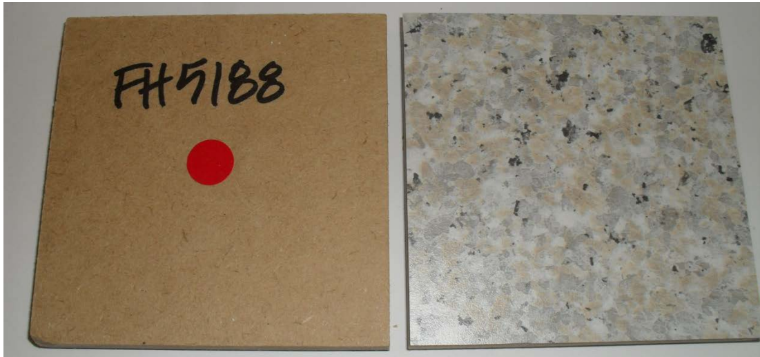
Figure 1 Representative specimens (unexposed face on left, typical exposed face on right)

The product submitted by the client for testing was identified by the client as Formica and Laminex High Pressure Laminate on Lakepine MDF Substrate. Figure 1 illustrates a representative specimen of that tested.